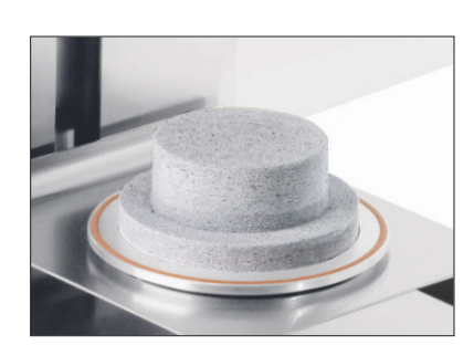
New firing chamber materials