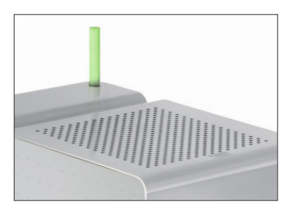
LED light bar