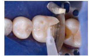
Condition the tooth substance