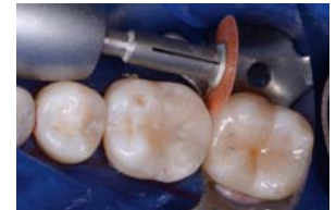
Remove excess cement