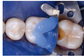
Etch the enamel and restoration

Note: Cement spacing is critical; a cement layer that is too thick may weaken the bond strength.