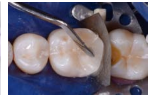
Insertion of the restoration