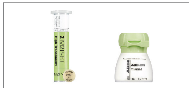
A successful package solution – VITA PM 9 and VITA VM 9 ADD-ON porcelains

porcelains assist us in the reproduction of natural aesthetics and can be used for making smaller corrections. Especially when time is of the essence, and everything has to fit perfectly, very good results can be achieved reliably with the VITA VM 9 ADD-ON porcelains. All in all, with the VITA PM 9 and VM 9 ADD-ON porcelains, VITA is offering a perfectly matched press-ceramic system.